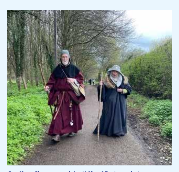
Geoffrey Chaucer and the Wife of Bath on their way to Bradwell Abbey from Canterbury.

outlined the design and development of the new city.