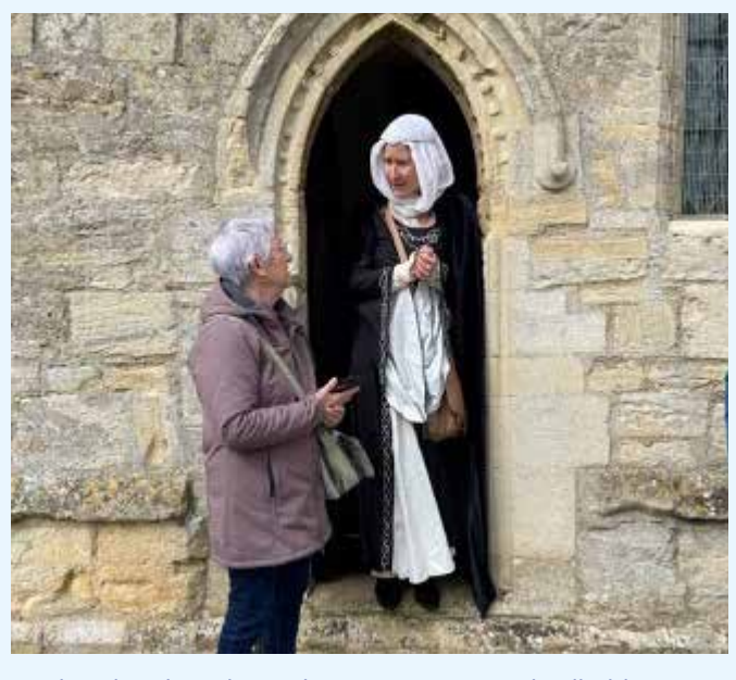
Medieval and modern pilgrims meet at Bradwell Abbey

Elsewhere on site, eager Easter bunnies hunted for eggs on the Annual Bradwell Abbey Easter Hunt, while their families enjoyed snacks from the Good Time Café, and busied themselves making Easter crafts. There were some excellent Easter bonnets on display!